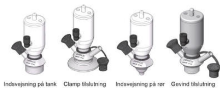
Indsvejsning på tank Clamp tilslutning Indsvejsning på rør Gevind tilslutning